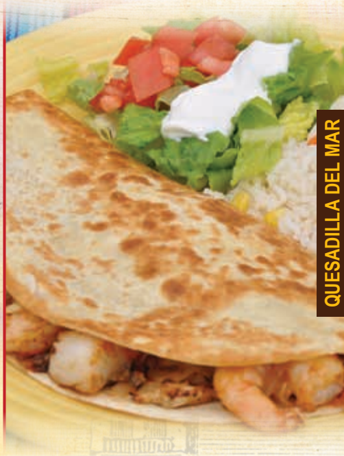
QUESADILLA DEL MAR