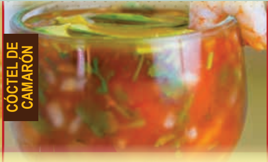
CÓCTEL DE CAMARÓN